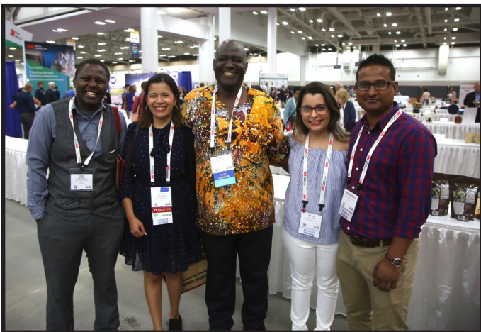
(from IAFP 2019)