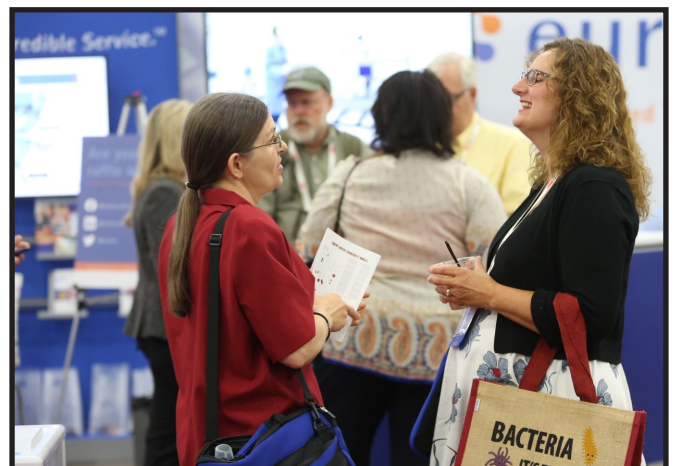
(from IAFP 2019)