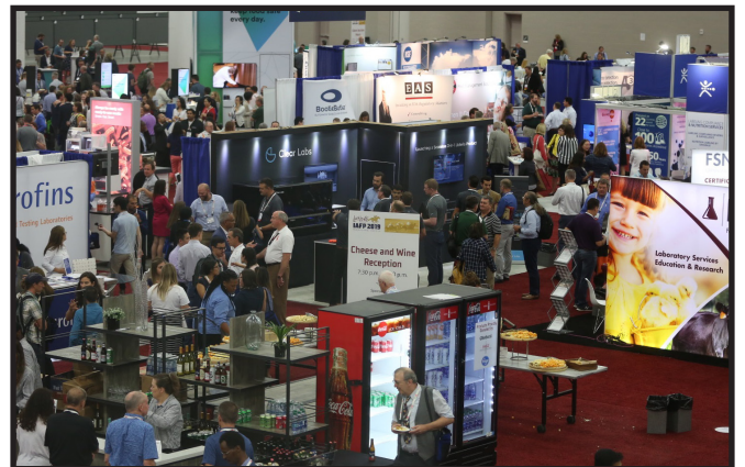
(from IAFP 2019)

RESERVE YOUR BOOTH SPACE ONLINE AT FOODPROTECTION.ORG