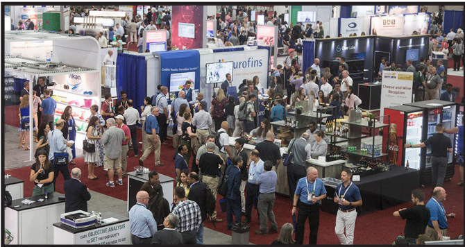
(from IAFP 2019)