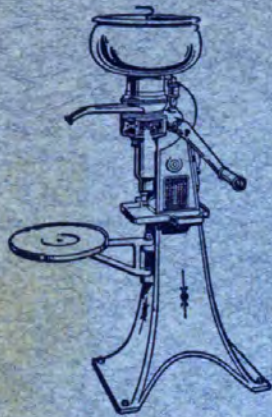
Laboratory Size, De Laval Milk Clarifier

Capacity 100 pounds per hour, Hand driven. Especially adapted for use by Boards of Health.